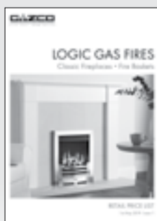
Logic Gas Fires & Fire Baskets