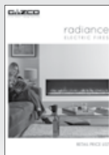
Radiance Electric Fires