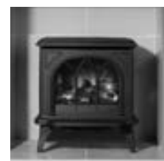
Electric Huntingdon 30 with Tracery Door