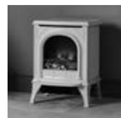
Electric Huntingdon 20 with Clear Door