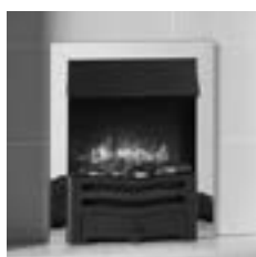
Logic2 Electric - Wave