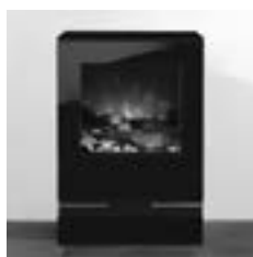
Vision Electric Small