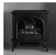
Electric Huntingdon 40 with Tracery Door