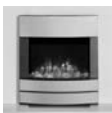
Logic2 Electric - Progress