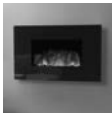
Studio 1 Electric - Glass