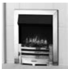
Logic2 Electric - Arts