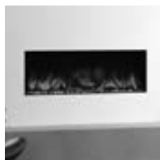
Studio Electric Inset 105R