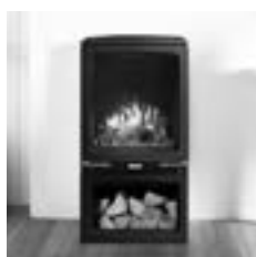
Vogue Midi Midine Electric