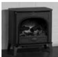
Stockton2 Medium Electric