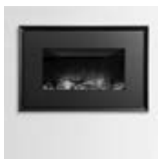
Riva2 670 Evoke Steel with Graphite Front and Rear