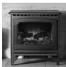
Marlborough2 Medium Electric