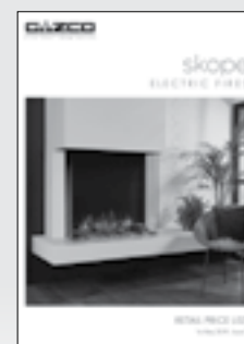
Skope Electric Fires