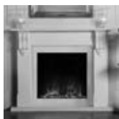
Riva2 Electric 70R with Victorian Corbel Mantel in Limestone