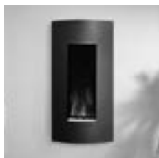
Studio 22 Electric - Verve