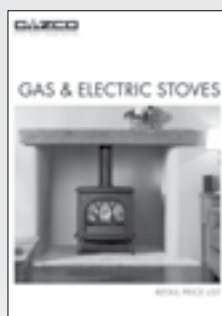
Gas & Electric Stoves